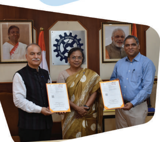
AcSIR- NIF Doctoral Innovation Fellowships